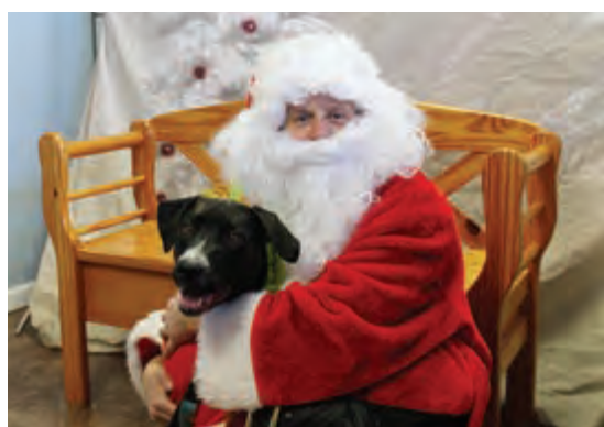
Pepper and Santa