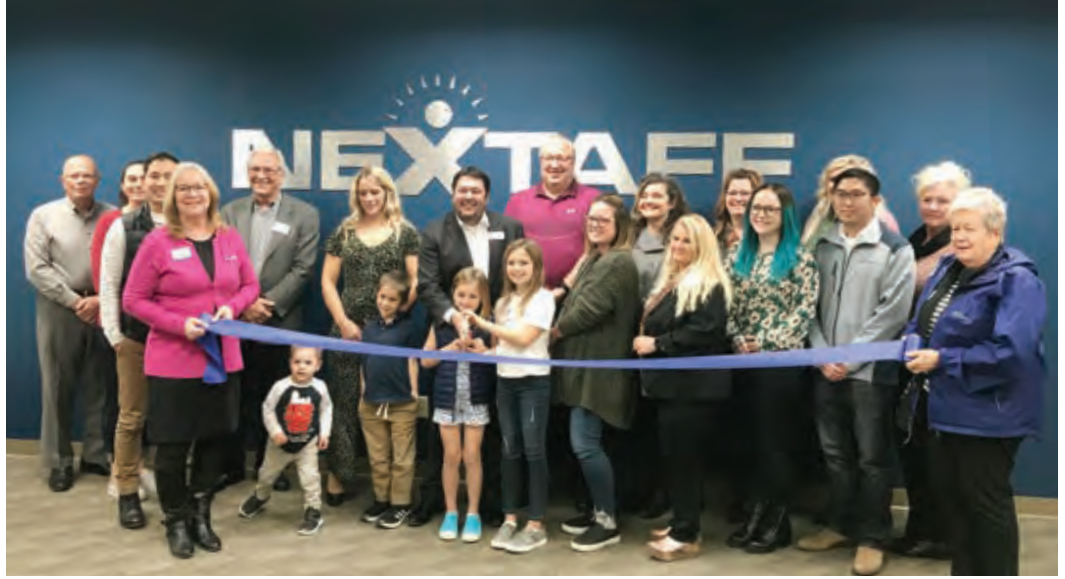
A ribbon cutting was held at Nextaff, 6600 Westown Parkway, Suite 200, in West Des Moines on Dec. 2.