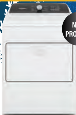
7.0 Cu.Ft. Capacity Electric Dryer Hamper Door WED5010LW