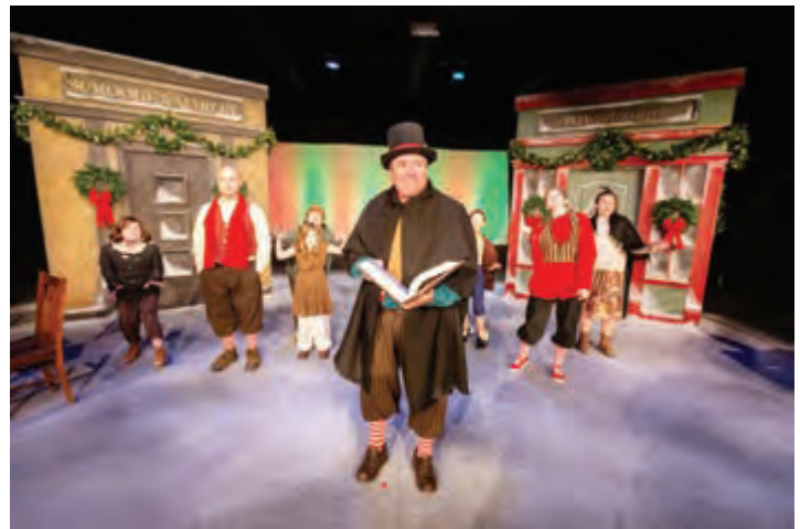
Tallgrass Theatre Company held its first production in its new venue.

The new theater has been well received, says Baskerville.