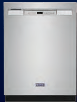
Stainless Steel Tub with 5 Cycles Dual Power Filtration Finger Print Resistant stainless steel. MDB4949SKZ

ADEL & Winterset T.V. & APPLIANCE • HEATING & COOLING