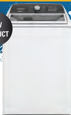
4.7-4.8 Cu.Ft. Capacity Top Load Washer with 2 in 1 Removable Agitator, Built-In Faucet WTW5057LW