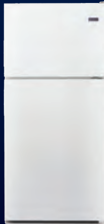
18 cu.ft. Top Mount Refg/Freezer 30" wide, glass shelves, LED Lighting, White MRT118FFFH