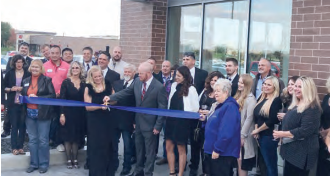
A ribbon cutting was held for Re/Max Revolution at Jordan Creek.