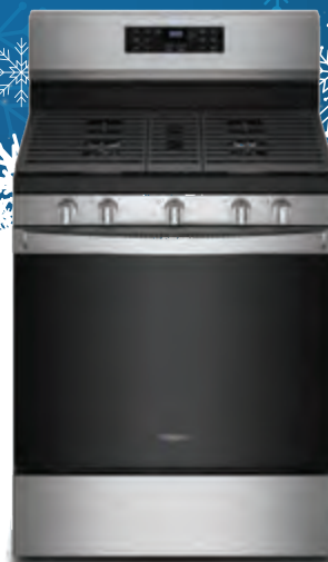
5.0 Cu. Ft. Whirlpool® Gas 5-in-1 Air Fry Oven Air Fry Mode Dishwasher-Safe Air Fry Basket Fan Convection Cooking SpeedHeat™ Burner LP Conversion available for extra cost WFG550S0LZ