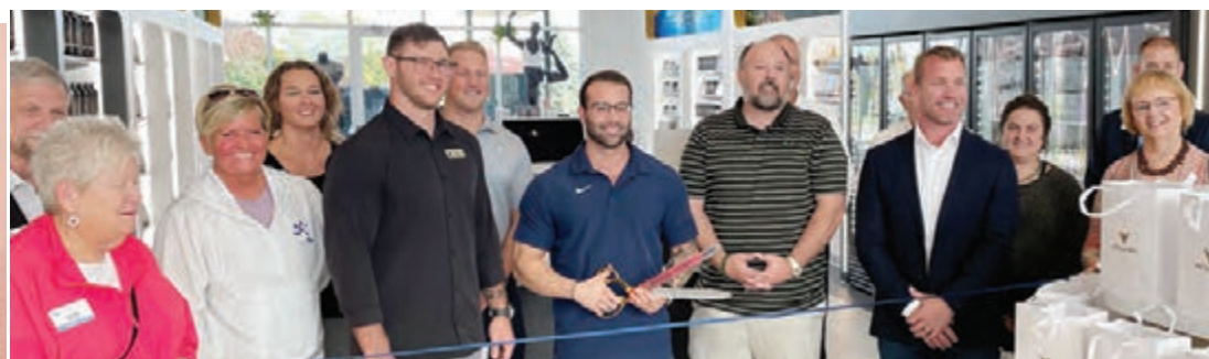
West Des Moines Chamber of Commerce hosted a ribbon cutting for NG Nutra, 210 Jordan Creek Parkway, on Oct. 4.