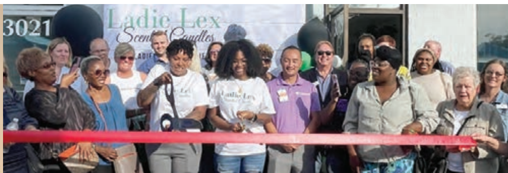
West Des Moines Chamber of Commerce hosted a ribbon cutting for Ladie Lex Scented Candles on Oct. 3.