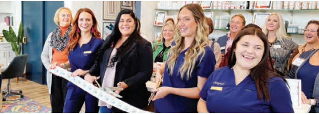
West Des Moines Chamber of Commerce hosted a ribbon cutting for Chapter Aesthetic Studio on Oct. 20.