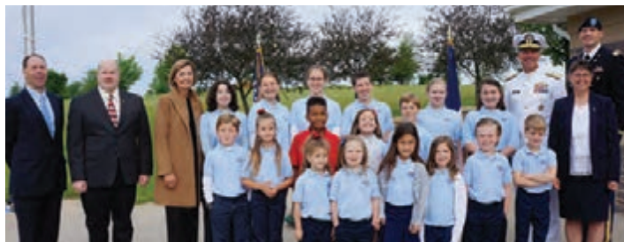
Members of the Young Patriots Club participate in patriotic programs.

"Whenever you teach, children grow and are inspired to be like these heroes. Heroes need to hear from us that they matter. We can make choices