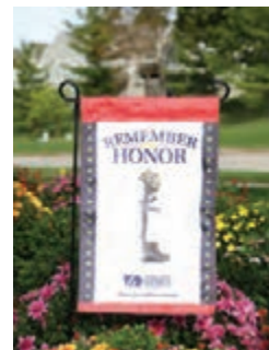
Deb and Jeff Hansen Foundation recognizes 600 Families of the Fallen on Gold Star Mother's Day.

This is the ninth year the Deb and Jeff Hansen Foundation's Project: Food and Fellowship program has provided families of the fallen with a special gift. ■