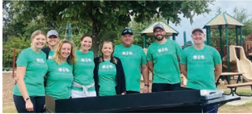
Polk City Friends of the Parks committee hosted a Party in the Park event on Aug. 20 in Leonard Park.