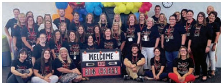
The staff at the new elementary welcomes all to the new school year.

A brand new school, Big Creek Elementary, located in Polk City, opened its doors on Aug. 23. The school serves approximately 370 third-, fourth- and fifth-grade students and includes a staff of 50 employees.