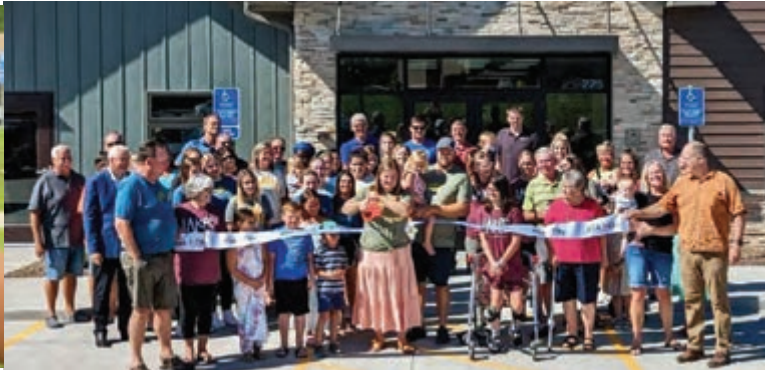
The Polk City Chamber of Commerce held a ribbon cutting for Lakes Early Learning Center on Aug. 10.