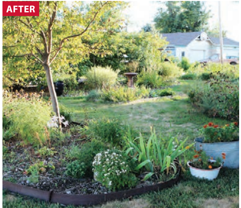
Arlene and Paul Sampson completed a landscaping job, which included planting dozens of trees, bushes and flowers, as well as a garden. Their backyard is an oasis for birds, with 15 bird feeders.

and levels to make this house. They eyeballed it and did the best they could.”