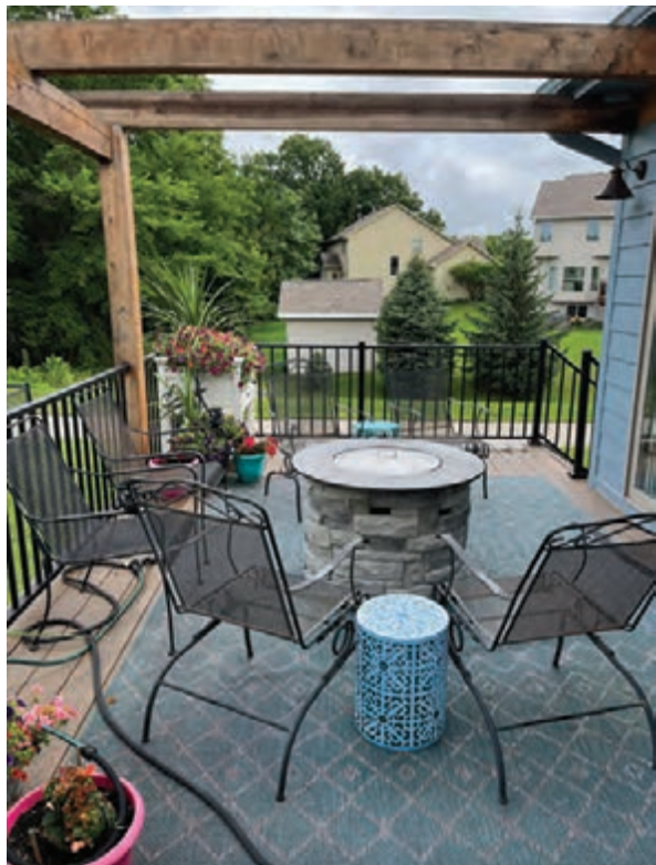
A pergola was added to the Spittlers' upper patio deck.