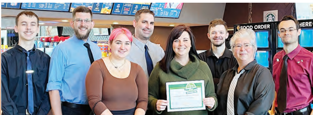
The Palms Theatre & IMAX staff