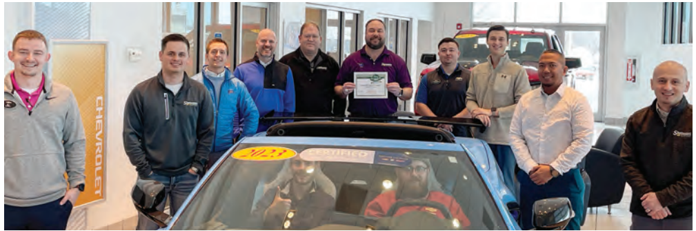
Shottenkirk Chevrolet staff members

Dallas County Residents' Choice certificates were presented to local businesses.