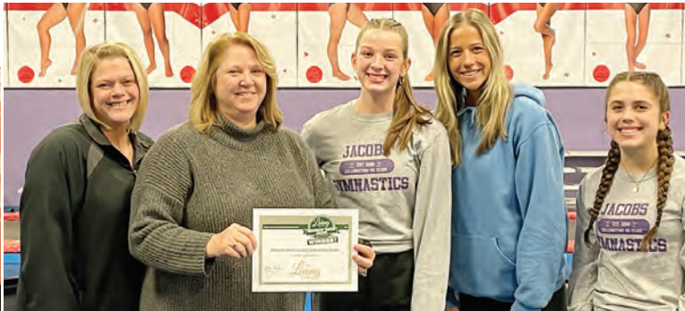
Jacobs Gymnastics staff